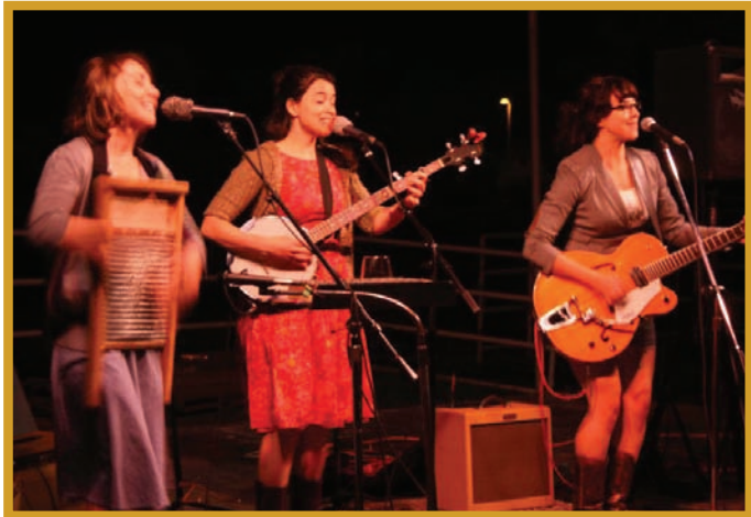
Silver Thread Trio